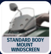
STANDARD BODY MOUNT WINDSCREEN