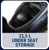
21.5 L UNDER SEAT STORAGE