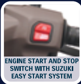
ENGINE START AND STOP SWITCH WITH SUZUKI EASY START SYSTEM