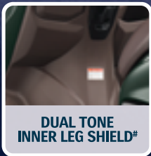
DUAL TONE INNER LEG SHIELD*

To give your vehicle's seat an elegant finish.