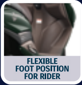
FLEXIBLE FOOT POSITION FOR RIDER