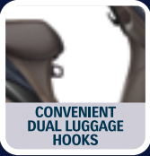
CONVENIENT DUAL LUGGAGE HOOKS