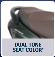
DUAL TONE SEAT COLOR*

To give your vehicle's seat an elegant finish.