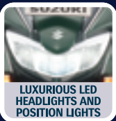
LUXURIOUS LED HEADLIGHTS AND POSITION LIGHTS