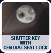
SHUTTER KEY WITH CENTRAL SEAT LOCK