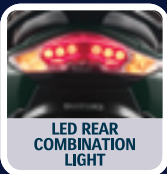
LED REAR COMBINATION LIGHT