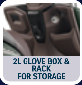
2L GLOVE BOX & RACK FOR STORAGE