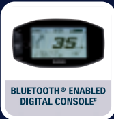
BLUETOOTH® ENABLED DIGITAL CONSOLE*