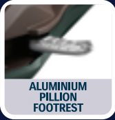
ALUMINIUM PILLION FOOTREST