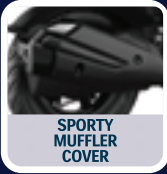
SPORTY MUFFLER COVER